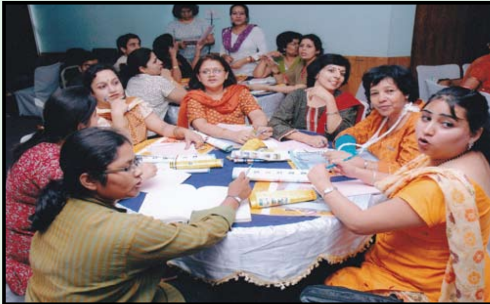
Enthusiastic Teachers working on the Draft of PEC Cards India at a Workshop