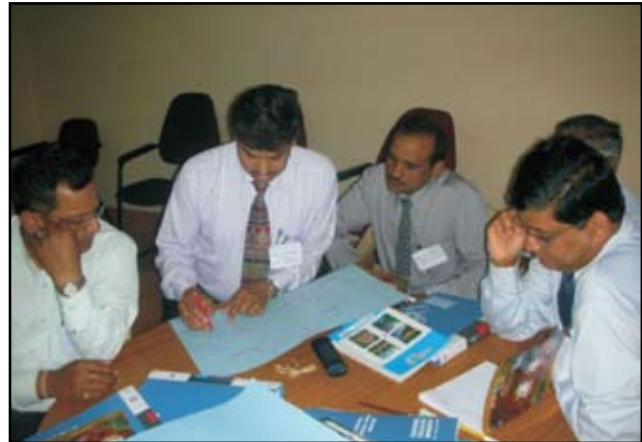
Teachers taking part in a group activity in one of sessions of Training Programme at Rashtriya Military School, Bangalore

Theme based learning is a life related, activity based method where knowledge and facts are not provided in isolation, but are related and built up. Constructivism refers to the idea that learners construct knowledge for themselves – each learner individually (and socially) construct meaning – as he or she learns. These two sessions saw maximum participation from the participants.