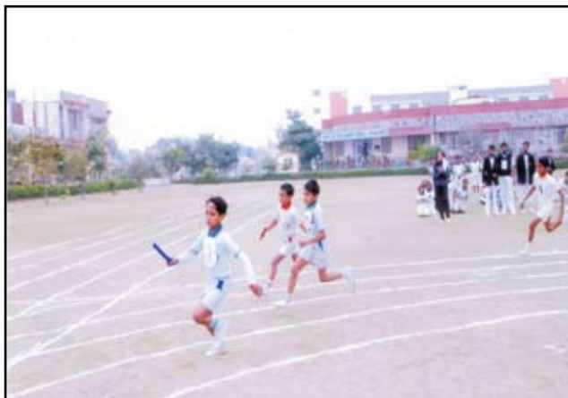
Students participating in Relay Race organised by Subodh Public School, Jaipur

To promote Physical Activity among students Subodh Public School, Jaipur conducts daily drills in the Morning Assembly. The physical teachers provide coaching on Yoga and aerobics to the students so that they can keep fresh all day long. Various Sports Competitions like Football, Volleyball, Kho – Kho, Handball, Basketball, Badminton, Chess, Skating, Athletic events etc. are organized