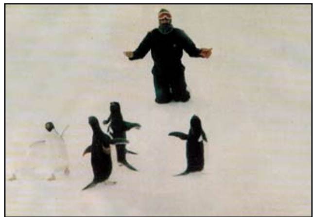
Author playing with Adele Penguin at Antarctica

It was an unending drama and each moment was a thriller. After a couple of hours, the penguins started to consider us as part of their group and some of them shared our dinner, which we ate in the rookery. When I was lying prostrate on the ice shelf two of them tried to pinch my wallet and handkerchief