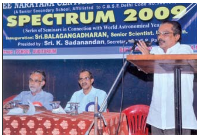
Celebration of Astronomical year at Sree Narayana Central School, Kollam