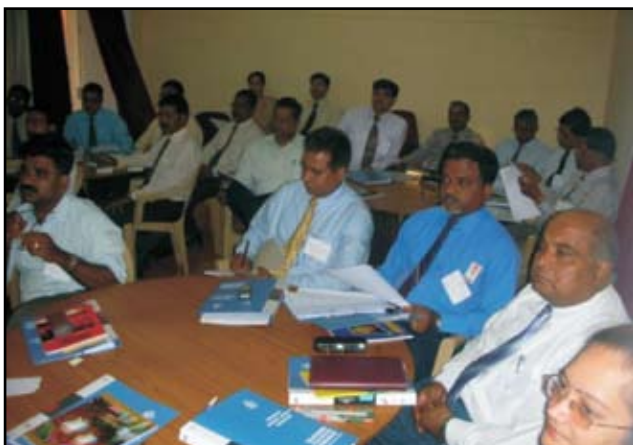
Participating teachers during Teacher Training Workshop at Rashtriya Military School, Bangalore

There were Brain Storming sessions on Effective Teaching Techniques, Multiple Intelligence, Theme Based learning and Construtivist Theory of learning, along with ways and means of incorporating them in the lesson plans.