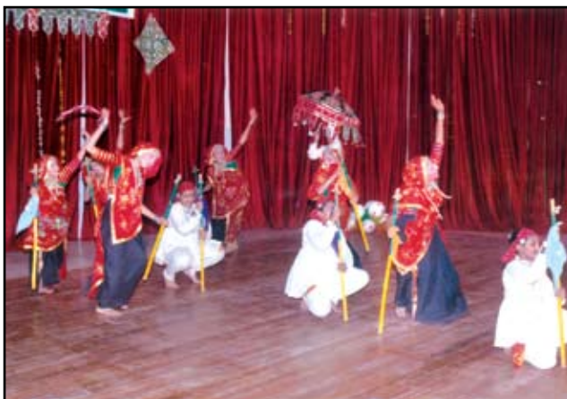
A team performing at DPS Rajkot during Folk Dance Competition

Delhi Public School, Rajkot hosted 'Folks Fun' – Inter DPS Folk Dance Competition (West Zone) on 11th July, 2009. Nine Delhi Public Schools – DPS Ahmedabad (East), DPS Ahmedabad (Bhopal), DPS Gandhinagar, DPS Jodhpur, DPS Udaipur, DPS Navi Mumbai, DPS Surat, DPS Jaipur and the host school DPS Rajkot participated.