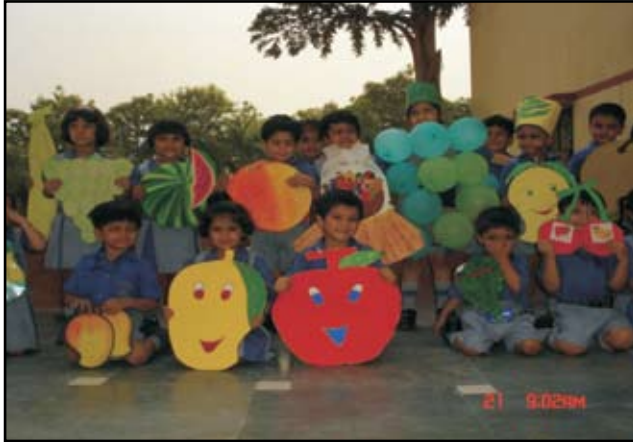
Students from Primary Wing of Modern Public School during 'Fruit Day Celebration'.