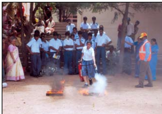
Students exhibiting their disaster management skills during a demo exercise organised by Bhartiya Vidya Bhawan's Public School, Hyderabad

The resource person showed a Power Point Presentation which highlighted the need of ' Emergency Response Team ' in times of disaster. He quoted Swami Vivekananda's quotation " Save yourself by yourself " which calls for common sense, presence of mind and attitude with which you can become a life saver. He also gave tips to be followed for fire safety in schools and also at home. He also emphasized the role of teachers in