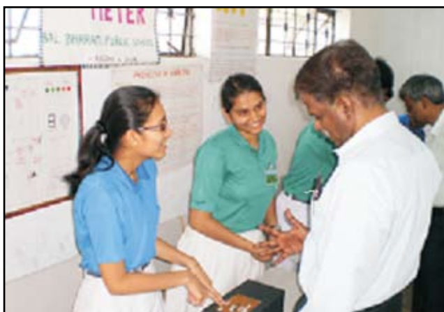
Students interacting with the visitors at the Mini Science Exhibition organised by Bal Bharati Public School, NTPC, Jhanor

Bal Bharati Public School, NTPC Jhanor (Gujarat) held its Annual Project Display on May 2, 2009 on the theme ' ENERGY and ENVIRONMENT '. The theme was chosen specially to spread awareness among students and parents about the need of saving energy to save environment. Unnecessary demand for more energy results in unscientific activities which can cause harmful effects on Environment. The students from Std I to XII displayed their exhibits on the occasion. The students made a genuine attempt to integrate Science and Environment in their exhibits. The works ranged from Sun,