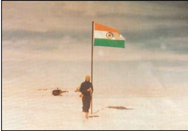
Author Hoisting the Tricolour at Antarctica