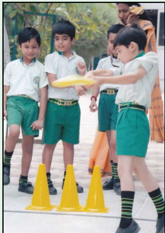
Children performing a suggested Sport activity at a Pilot Workshop

The workshop ensured the implementation of PE Cards across all the CBSE schools and would also effectively support in some measure towards the delivery of the Sarva Shiksha Abhiyan – a programme to ensure universal education for all at the primary level.