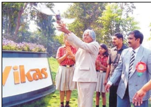
Dr. APJ Abdul Kalam Freeing the Symbol of Peace "Pigeon" at Vikas Vidyaniketan, Visakhapatnam

Honourable Ex President of India Dr. APJ Abdul Kalam, visited Vikas Vidyaniketan,