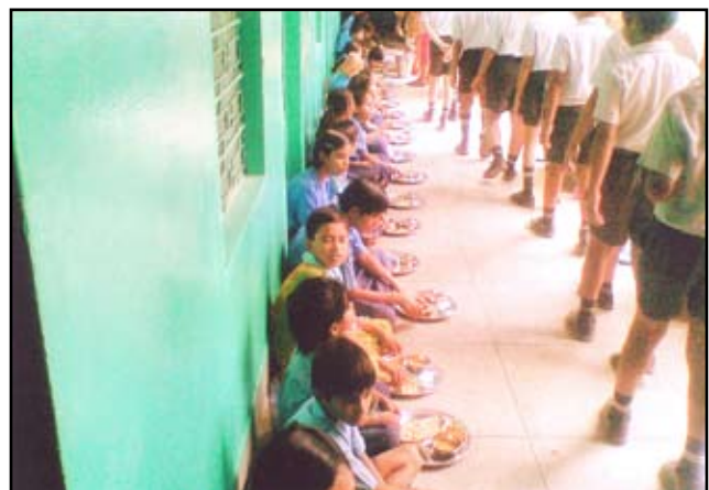
The Students of Vidyashram Jodhpur offering lunch to Blind Students from the orphanage

VIS children prepared handmade colorful Rakhis. Class V students started on 4th August '09 with these Rakhis, sweet boxes and the things required for pooja to the orphanage. They were