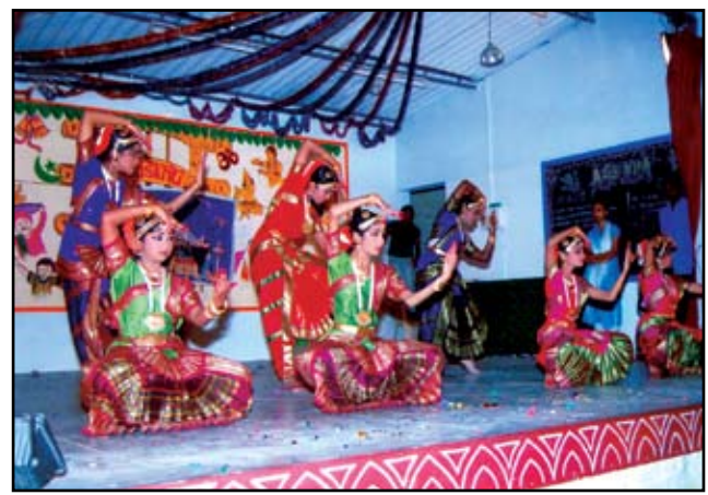
Dance Competition at Shisya School, Hosur