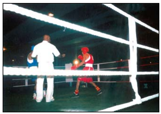
A still shot from 24th Men's Sub Junior National Boxing Championship