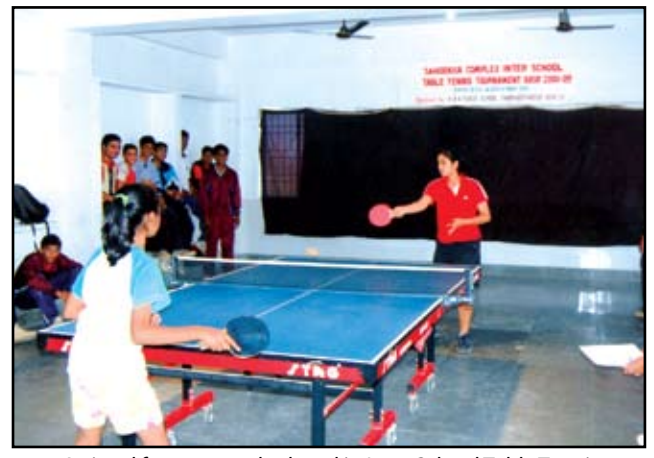
A visual from a match played in Inter School Table Tennis Tournament organised by DAV School, Chandrasekharpur

An Inter School Dance Festival was organized and hosted by Presentation Convent Sr. Sec. School, Gandhi Nagar, Jammu on 16th Feb' 2009. Twelve different schools participated in the Dance Festival competition and were judged on the basis of categories such as Choreography, Synchronization, Music, Authenticity of Costume, Stage Presentation and Exposition etc.