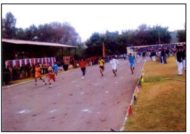
Athletic meet organised by Jammu Sahodaya Complex

A two day Inter School Debate, Quiz and Painting Competition was held on 11th and 12th Dec' 08 at K.C. Public School, Jammu.