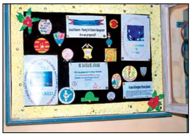
Logos prepared by the students in Logo Making Competition

On the occasion of 'Earth Day' at S.S.D.P.S, a chart making competition was organized. The students by writing poems, articles and captions, highlighted the need to protect mother earth. A 'Logo making' competition was also organised on the topic 'Be prepared Be aware' which brought awareness among students regarding disaster management. Moving ahead in the same direction the school has also inbuilt water harvesting system to augment the water resources.