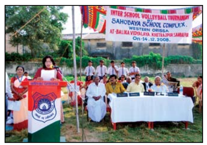
Inaugural function of Sahodaya Inter School Complex, Western Orissa

Volleyball (boys) and Throwball (girls) Tournaments at Bangalore Sahodaya Schools Complex