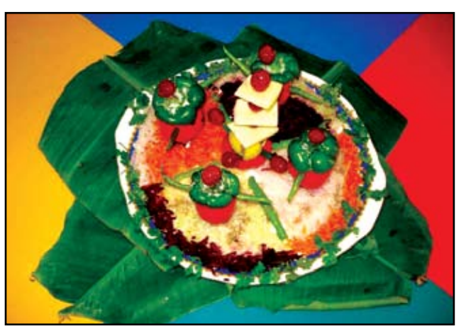
A beautifully garnished Salad Sample displayed during Salad Making Compettion at Aditya Birla Public School, Veraval, Gujarat

Inter-House Salad An Making Competition was organized for the students of classes VIII and IX. The objective behind the competition was to inculcate healthy food habits and awareness regarding the choice of food among the youth. Each House was represented by four members. Cleanliness, safety, taste and presentation were the basic criterion for the judgment. The participants' creativity was revealed through the beautiful designs and patterns formed with different mouth watering salad.