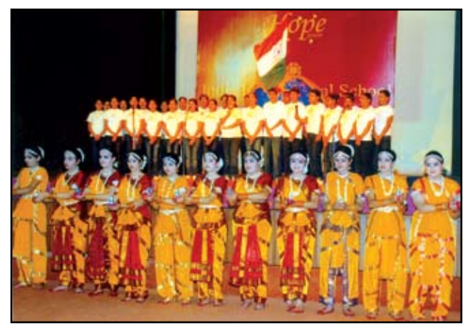
Students performing a group activity in a cultural programme 'Hope' at India International School, Jaipur

India International School, Jaipur organised a cultural programme named 'HOPE 2009' for the parents on 18th January, 2009. The programme took the audience on a journey