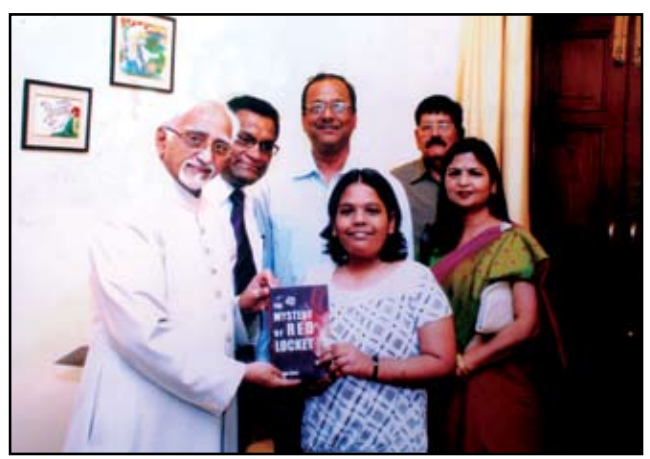
D.A.V. Public School, Faridabad student with the honourable Vice President of India at the release of the book written by her.