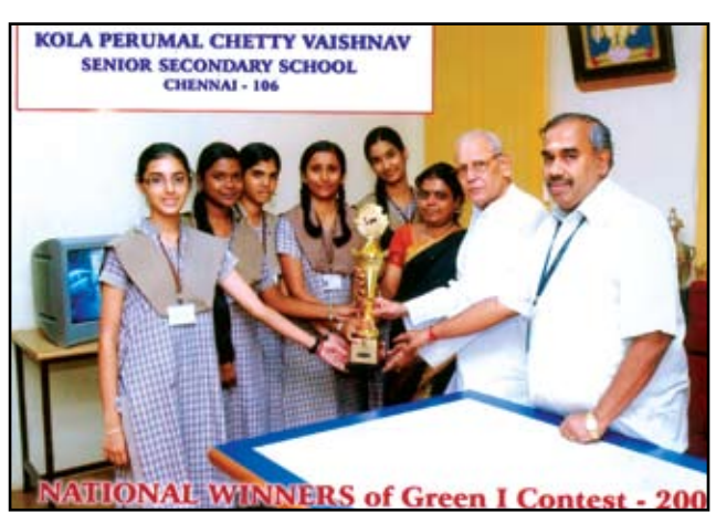
Winning team of 'Green I' Contest

In association with Green Planet Bicycle Riders Association , an NGO working for the cause of environment, Bal Bhawan School, Bhopal organized painting and quiz competitions .